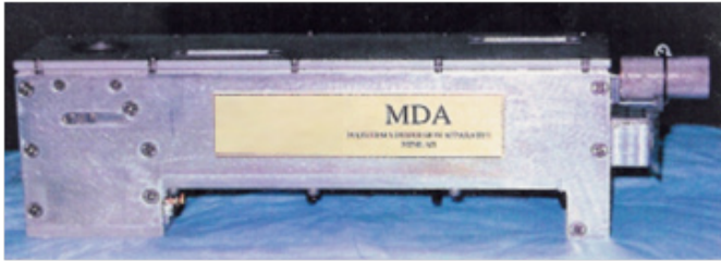
3rd Generation MDA Flown on Space Shuttle